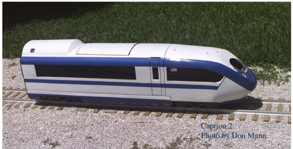
Caption 2