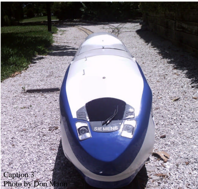
Caption 3