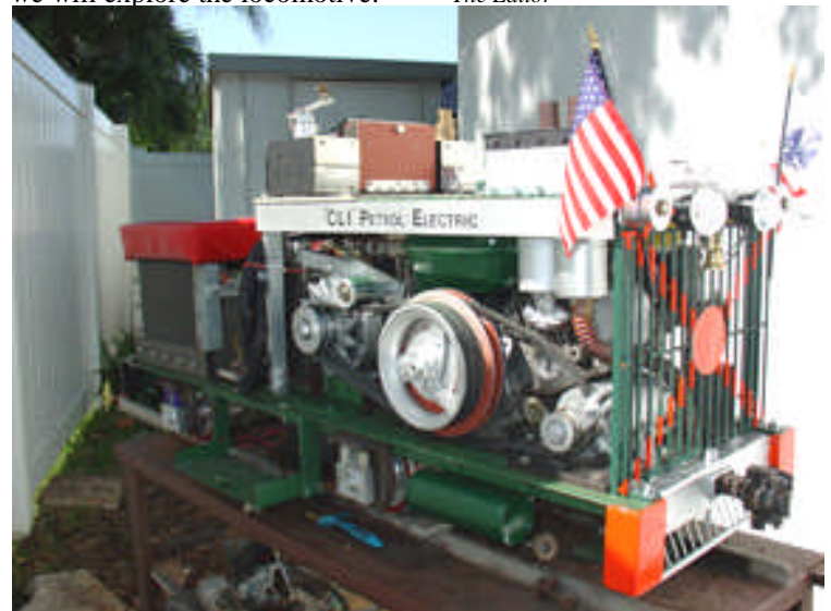
Belt Guard taken off for clarity.